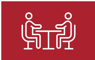
Step 1: Plan

We encourage you to develop a plan for how you, your family, and caregivers will respond to a potential illness or hospitalization. Having a plan can help reduce stress in the event of an emergency and help everyone transition. Start by having a conversation with everyone involved and use this as a guide.