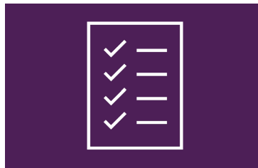
Step 2: Prepare