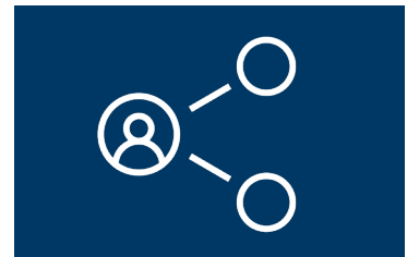
Step 3: Share